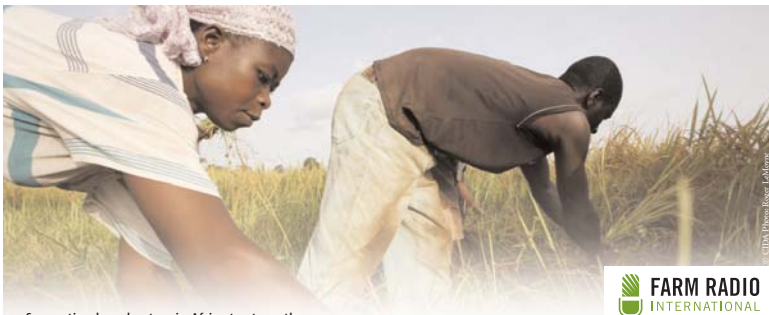
Supporting broadcasters in Africa to strengthen small-scale farming and rural communities